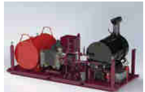
Powered by a PowerTech M 4.5L engine, the GT-70 will warm the temperature of 575 liters (125 gallons) by 58-degree Celsius (137-degrees Fahrenheit) in one minute.