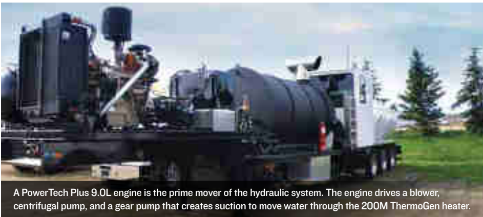
A PowerTech Plus 9.0L engine is the prime mover of the hydraulic system. The engine drives a blower, centrifugal pump, and a gear pump that creates suction to move water through the 200M ThermoGen heater.