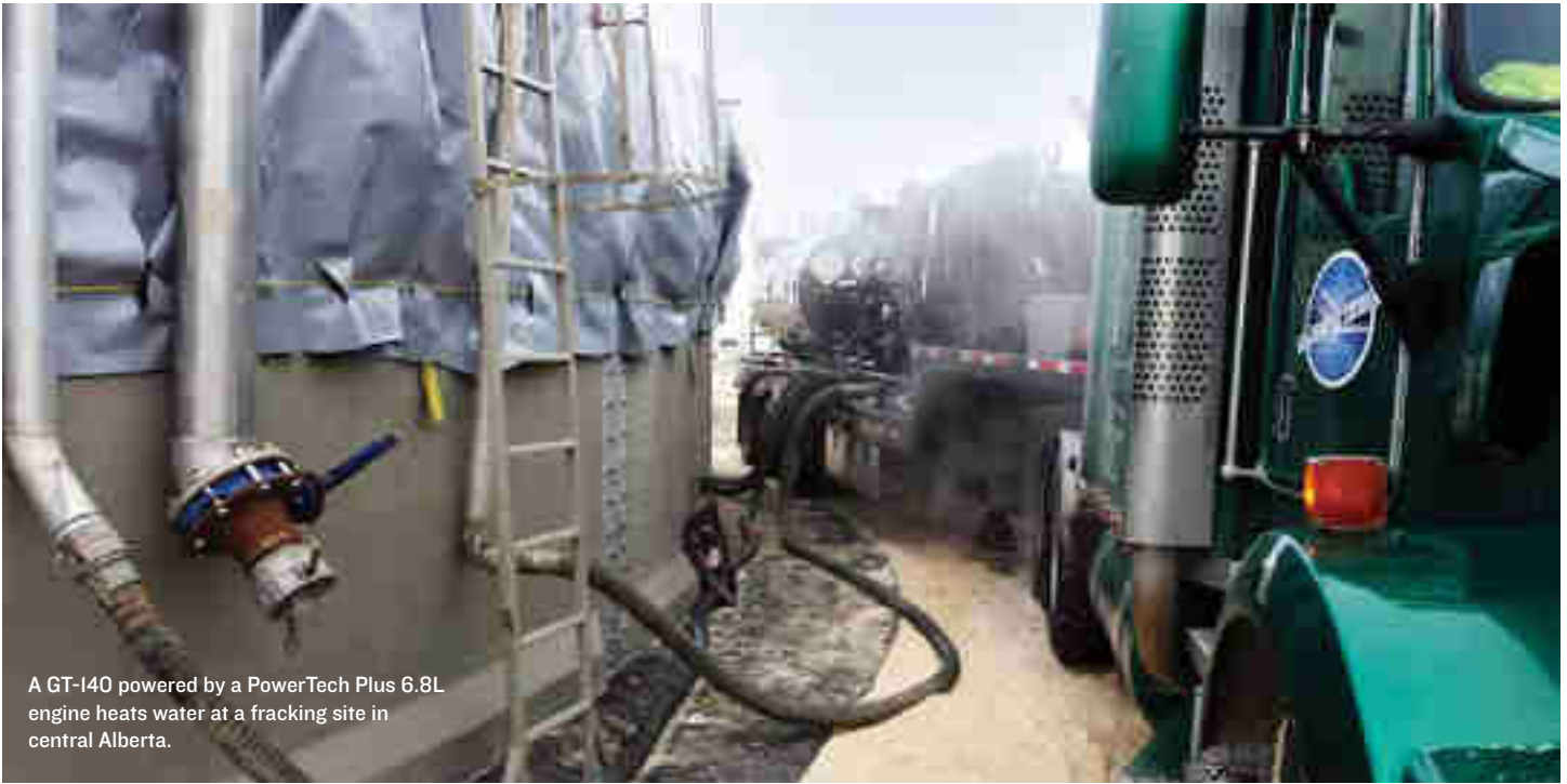
A GT-140 powered by a PowerTech Plus 6.8L engine heats water at a fracking site in central Alberta.